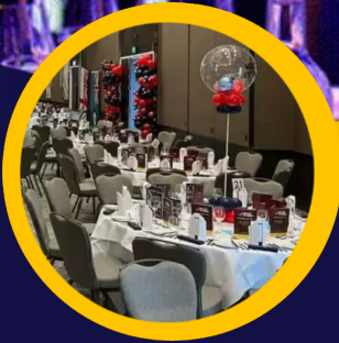
TABLE SPONSOR £1000

Treat yourself and your guests to the Military vs Cancer experience